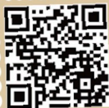
Safeguard HK Mobile App

Travellers should remain vigilant about the local safety situation when travelling abroad. In case of emergencies, you can also contact the Immigration Department or Chinese Embassy/Consulate at your destination.