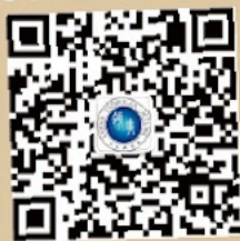
WeChat Official Account of Consular Services