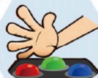
Bishi Bashi Game

Get a gift set upon completing the "Safe Community" mission