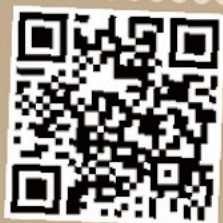
HK Immigration Department Mobile App