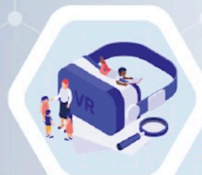
Virtual Reality Games

Free shuttle bus services from and to University Station (Departure time at University Station: 1030 – 1530 hours)