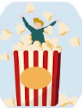
Gift Set & Light Refreshments