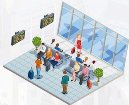
Large Crowds in an Indoor Confined Space