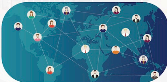
Significant Casualties Involving Multinational Passengers