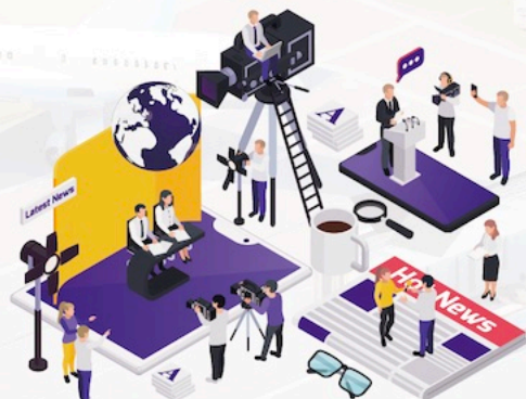
Mass Media Attention