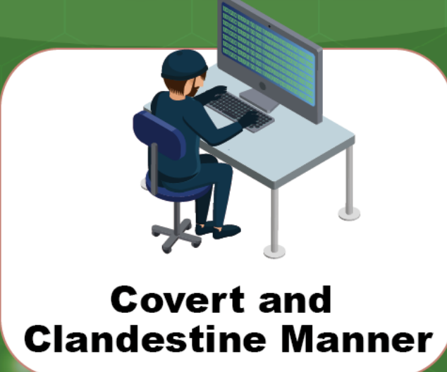
Covert and Clandestine Manner

A small number of local radicals continued to act in a covert and clandestine manner and took to a variety of channels to spread extremist ideologies. Recent cases involving explosives and weapons also suggested that they retained the intent and capability to stage attacks and acquire lethal weapons.