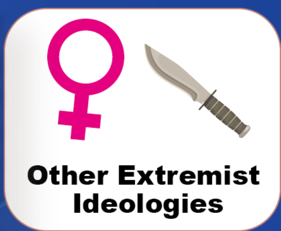
Other Extremist Ideologies

The threat posed by far-right extremism and other extremist ideologies was on the rise, with “misogyny extremism” raising serious concerns. In April 2024, an Australian male stabbed five women and one male security guard to death at a mall in Sydney, Australia. It was revealed that the attacker mainly targeted women due to his failure to find a girlfriend. Several countries are reviewing to list “misogyny” as a form of extremism in order to develop more effective counter terrorism strategies.