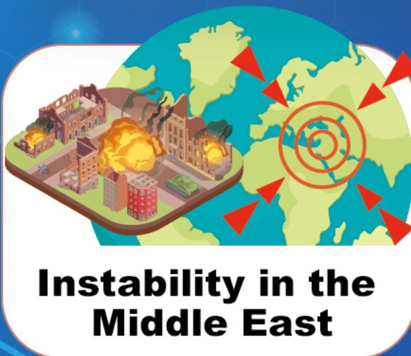
Instability in the Middle East

In addition, the background of instability in the Middle East and escalating geopolitical friction might provide a fertile ground for terrorist groups to develop and expand their power, posing new challenges for the global security landscape.