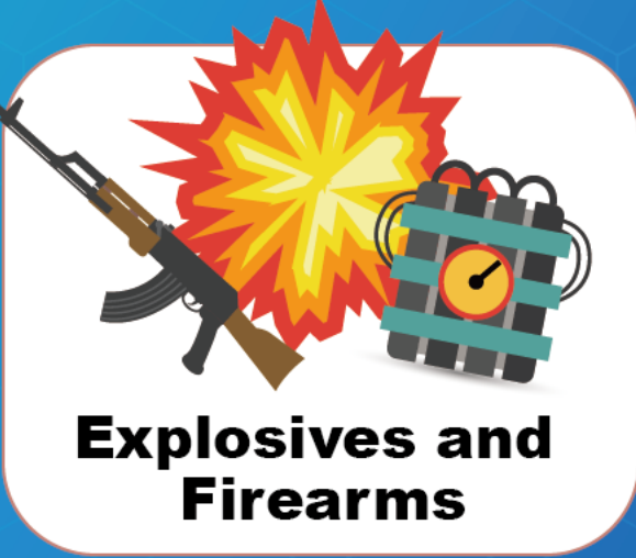
Explosives and Firearms

Against the background of geopolitical tensions and drastic changes in international situations, the global terrorism situation remained complex and heightened. Terrorist groups such as Islamic State of Iraq and the Levant (ISIL) and their affiliates continued to stage attacks with weapons such as explosives and firearms. In March 2024, a number of ISIL attackers stormed a concert hall in Moscow, Russia causing at least 144 deaths and over 500 injuries. It was one of the deadliest terrorist attacks in recent years.