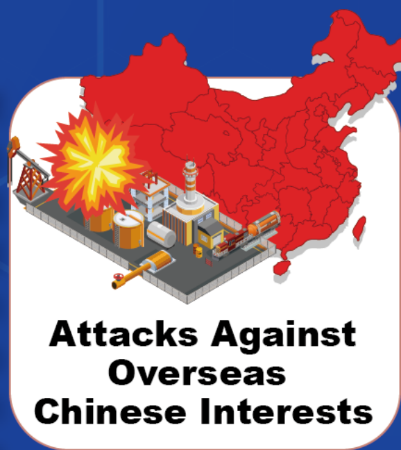
Attacks Against Overseas Chinese Interests

With the increasing investment from the Mainland along the “Belt and Road” initiative, there were ongoing attacks against overseas Chinese nationals and interests. Meanwhile, some prominent terrorist groups also kept disseminating propaganda against the Mainland to incite anti-Chinese sentiment. In October 2024, Balochistan Liberation Army, a Pakistani militant group, staged a car bomb attack against a Chinese investment project near the airport in Karachi, resulting in four deaths and 17 injuries, including the killing of two Chinese nationals and the wounding of another.